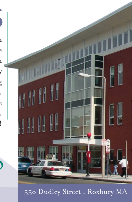
550 Dudley Street . Roxbury MA

Construction on Project Hope's state of the art, earth friendly, four story community building comes to a close, amidst applause from neighbors, clients and staff!